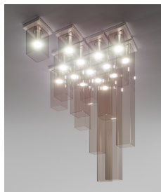
TUBES PL 15