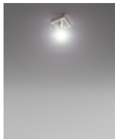
TUBES PL 20