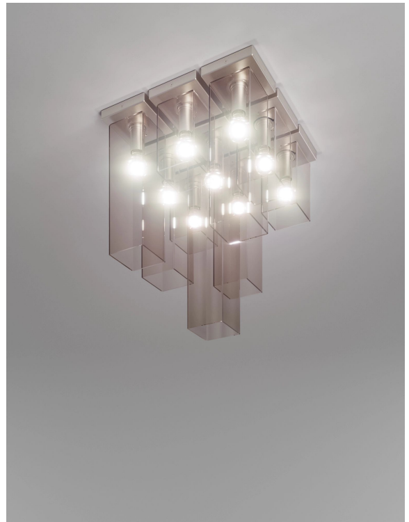
TUBES PL 9 FUTR NO E27 CE