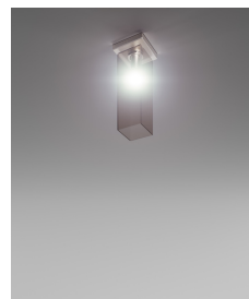
TUBES PL 40