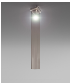
TUBES PL 120