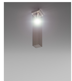
TUBES PL 60