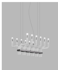
STRDU SP R