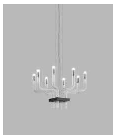
STRDU SP Q