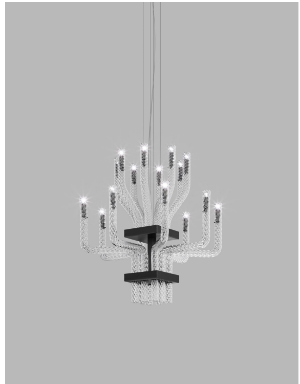
STRDU SP DOP CRR1 NN G9 CE