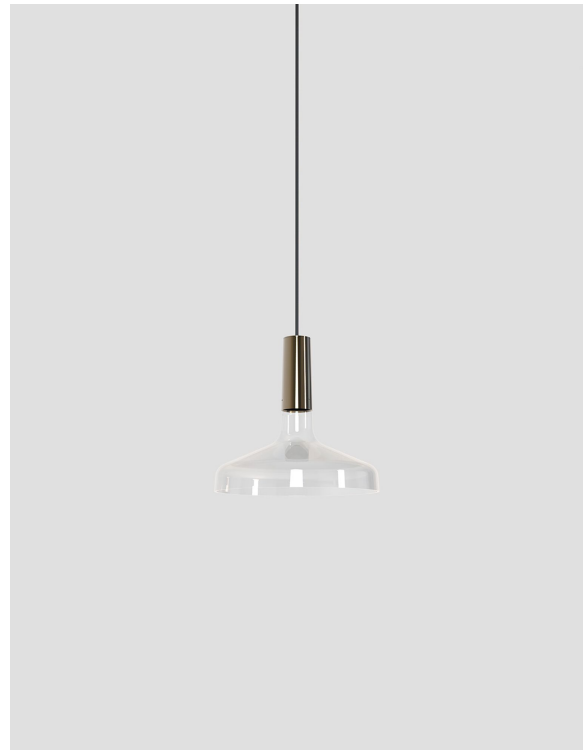
SCINT SP G CRTR BH L22 CE