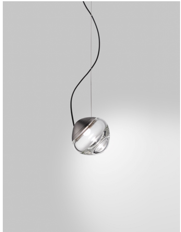
PURE SP CRTR ANT L22 CE