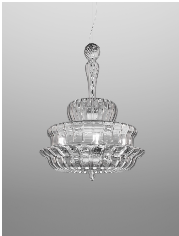
NOVEC SP G CRRI CR 14E CE