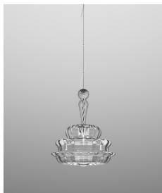
NOVEC SP M