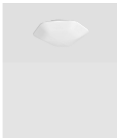
MODUL PP G