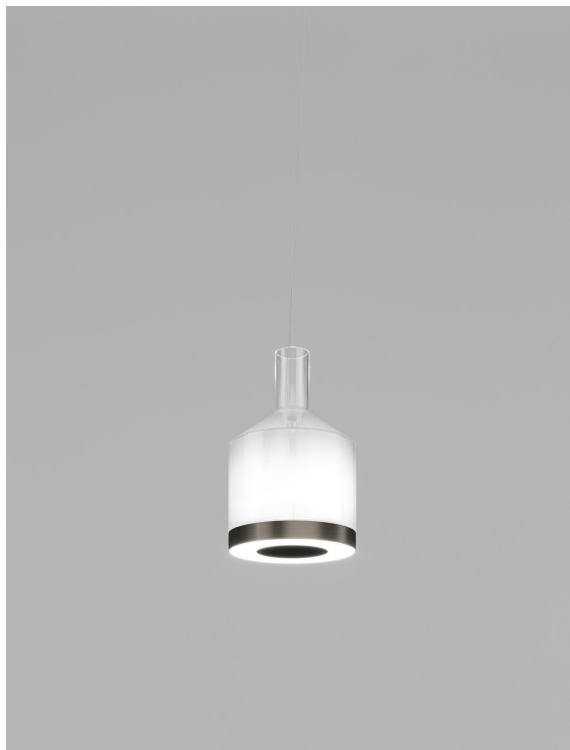
MEDEA SP 1 BCSF AVS L22 CE