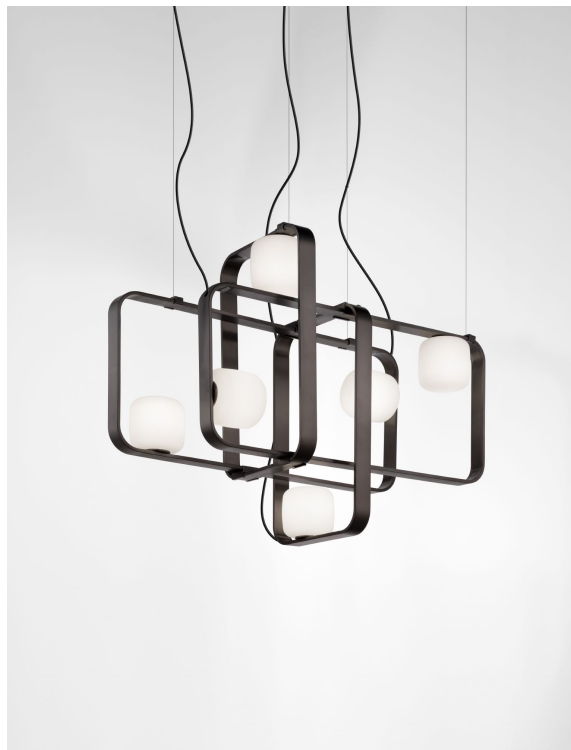
GROOV SP 4 BCST ANT E14 CE