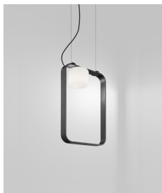
GROOV SP 60