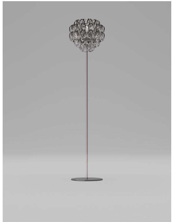
GIOGA PT CRNN CR E27 CE 1