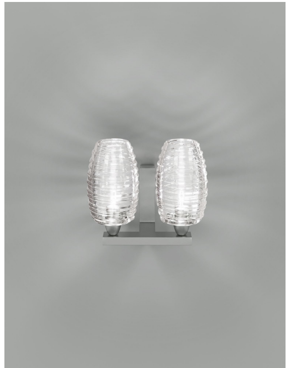
DAMAS AP 2AP CRCR NI G9 CE