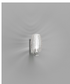
DAMAS AP 1A P