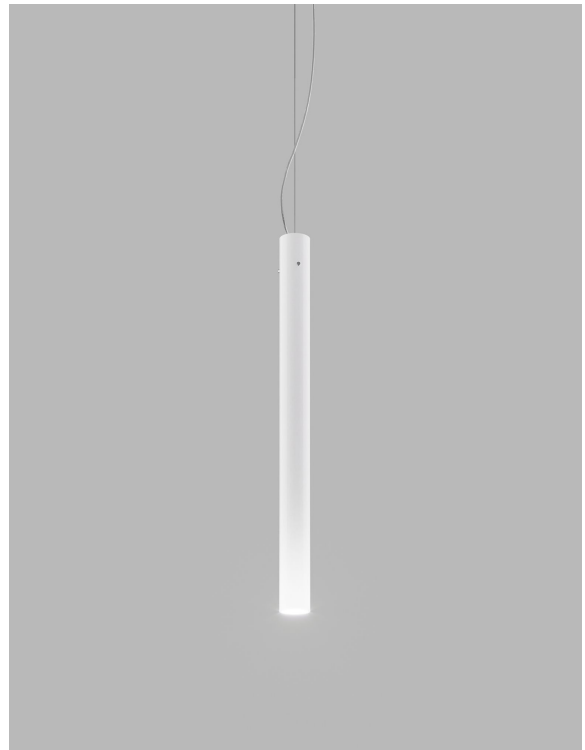
CANDE SP BCLU CR G9 CE