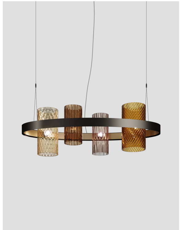
ARMON SP OV1 MC1 N_O E14 CE